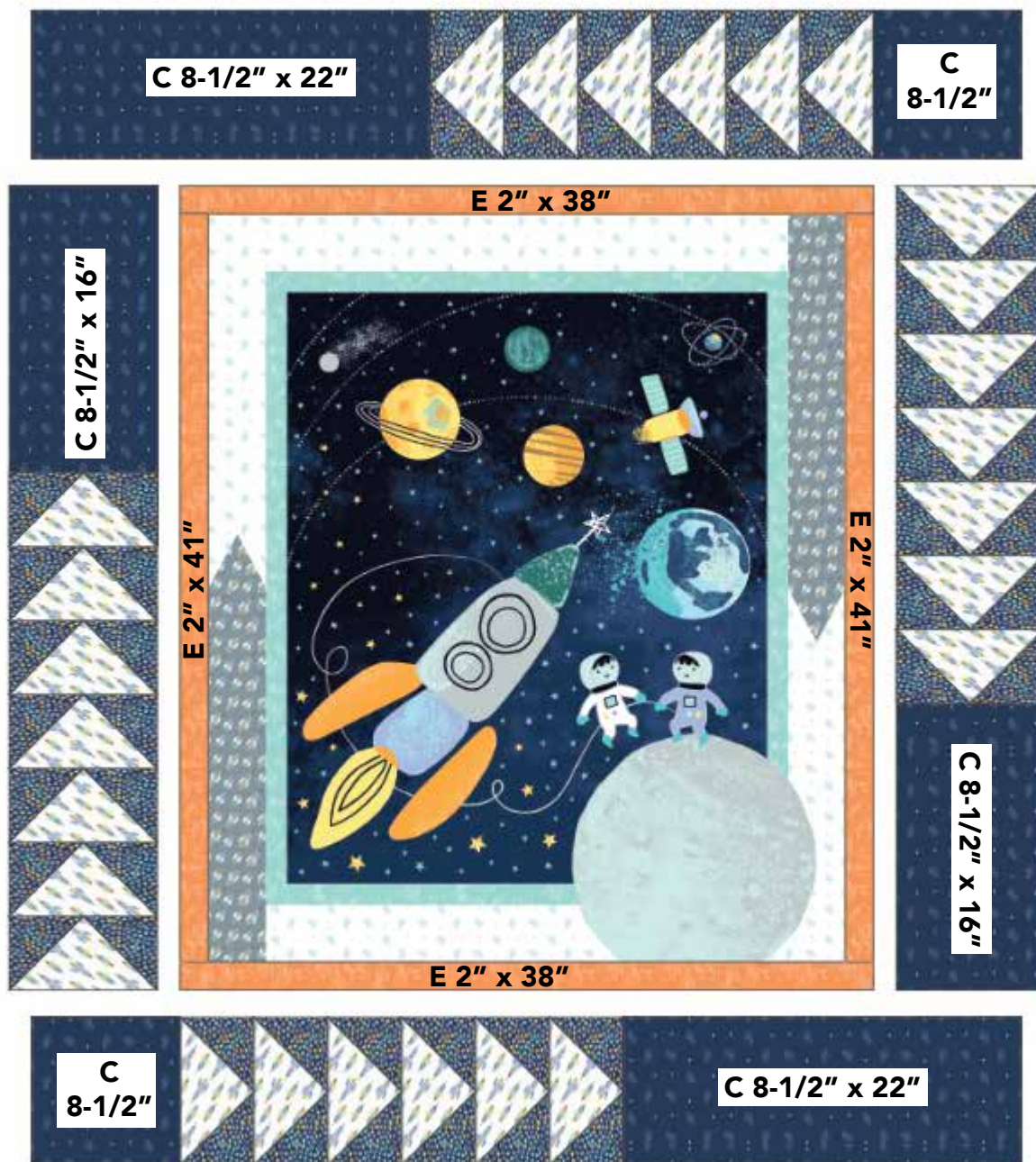
Quilt Assembly Diagram